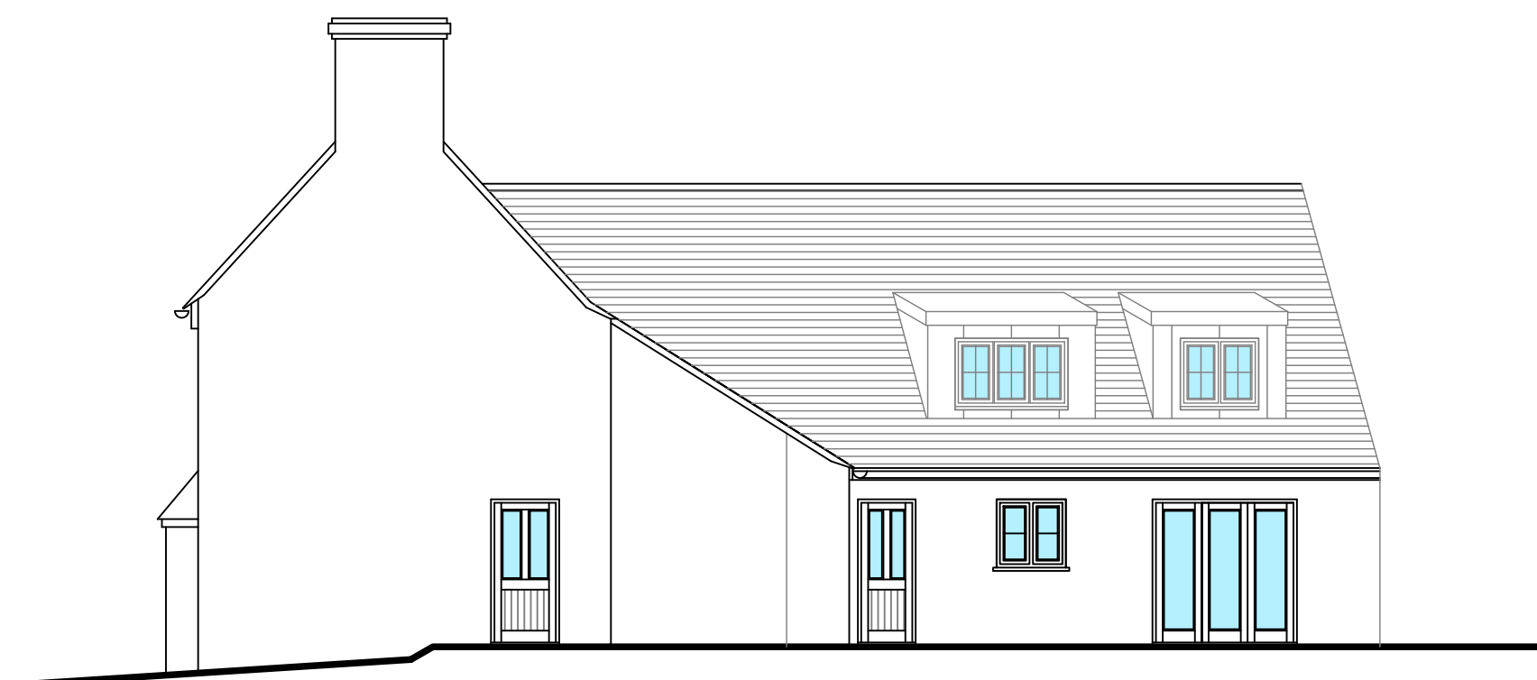
South East Elevation